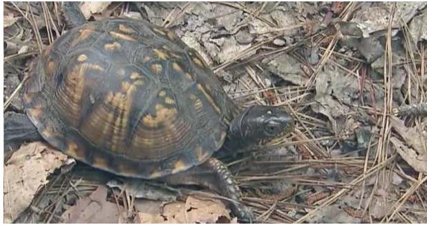
Click the picture above to watch the Tarheel Traveler episode about the Turtle Man!

I can guarantee you that train fans young and old will have an incredible time when you visit this museum. There is also a box turtle rescue and release pen beside the museum that is open to the public.